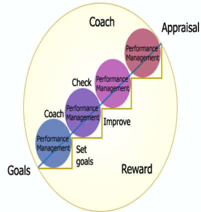
Performance and Reward